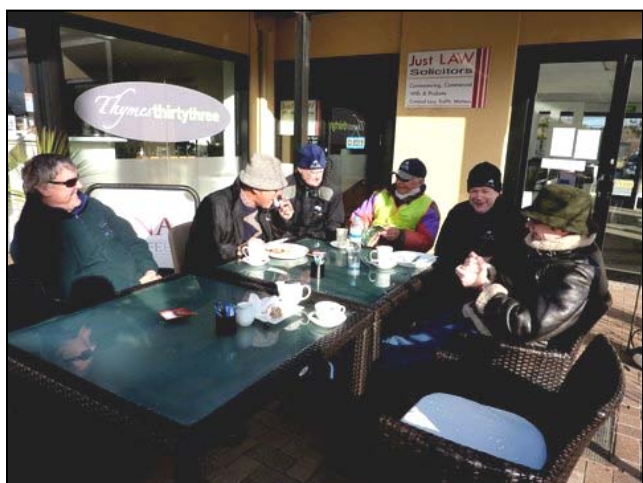
The President holds court at Bungendore.