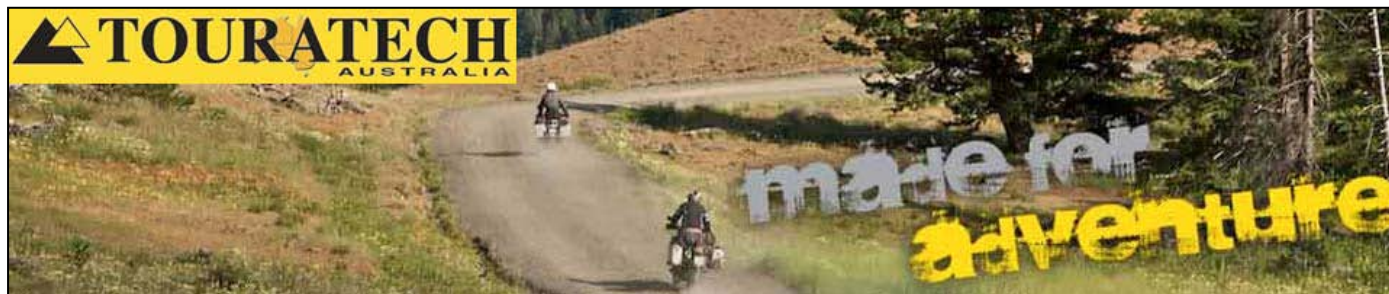
From Touratech News: G 650 GS: Touratech Accessories for BMW's New Single Cylinder Bike

For more information, visit www.rallyindochina.com , email info@exploreindochina.com or follow us on Twitter at @rallyindochina.