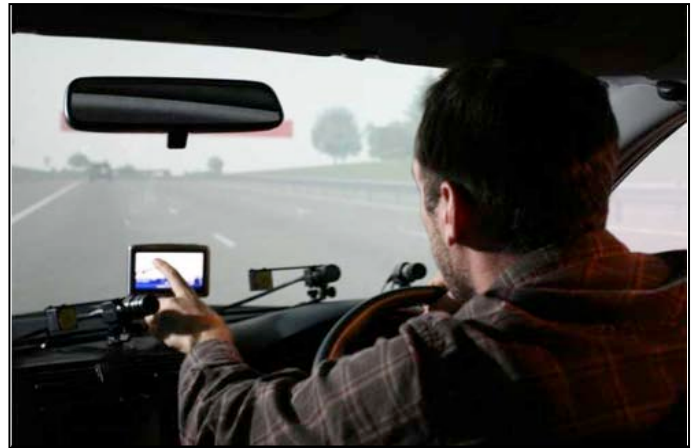
Some drivers believe they may be subconsciously influenced by a desire to 'beat the clock' once a target has been set.

(Editor: Originally read in Saturday Canberra Times 30 July 2011.)