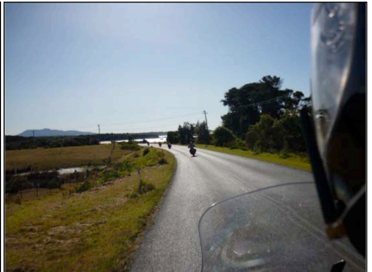
Some pictures from Jack Foley's ride to Eden ~June 2011