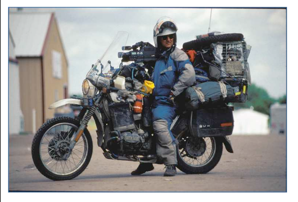
When men-were-men and bikes had no alloy; what, there's 5kg limit per pannier?