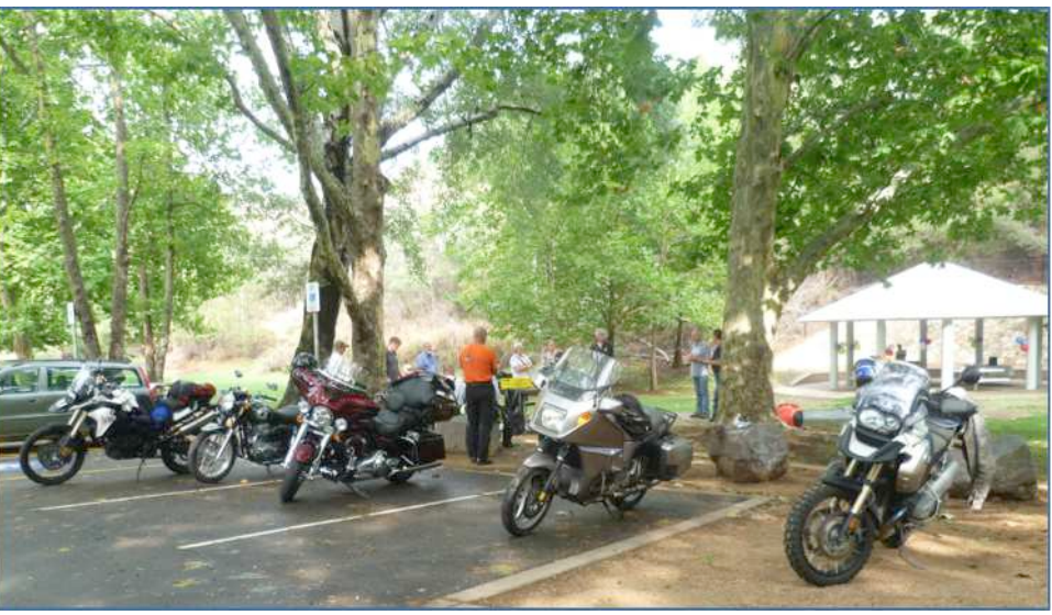
February's Monthly Meeting & Breakfast was held under leaden skies at the Cotter Dam Reserve