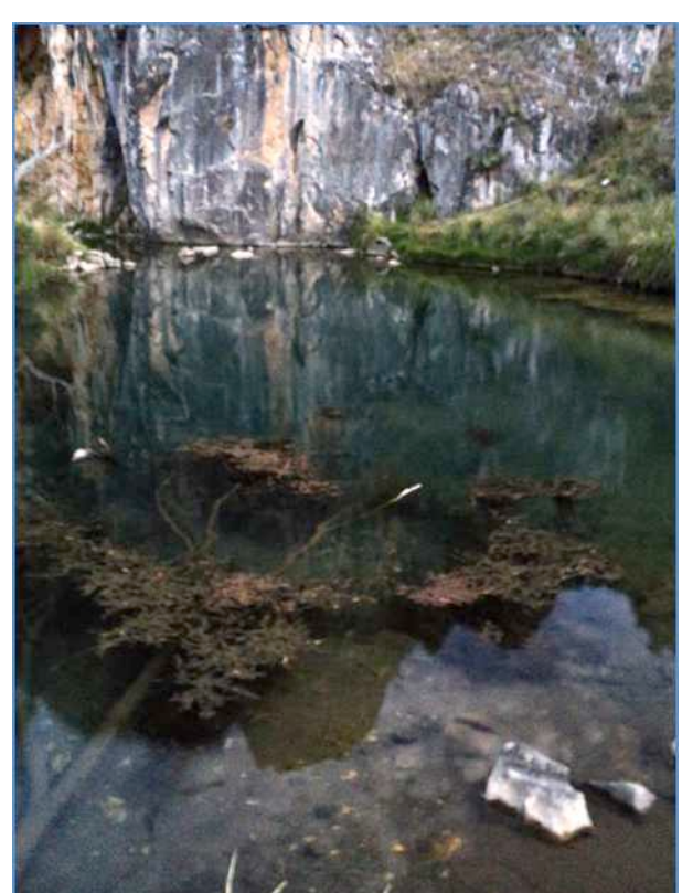
The unimaginatively named but nonetheless scenic 'Blue Waterhole'.