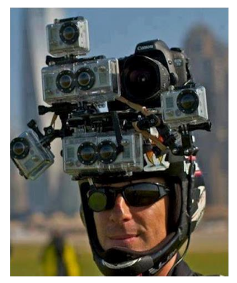
2012 Helmet Cam Award Winner