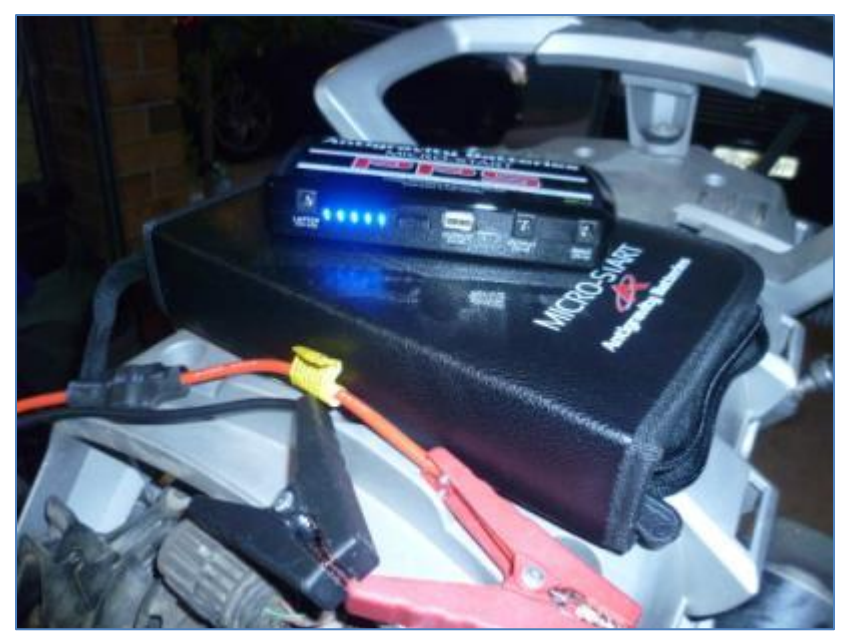
Micro-Start PPS charge level confirmed for jump starting with 5 LED's lit up

Maintaining the PPS is as simple as connecting the PPS and charging it every 3 - 4 months.