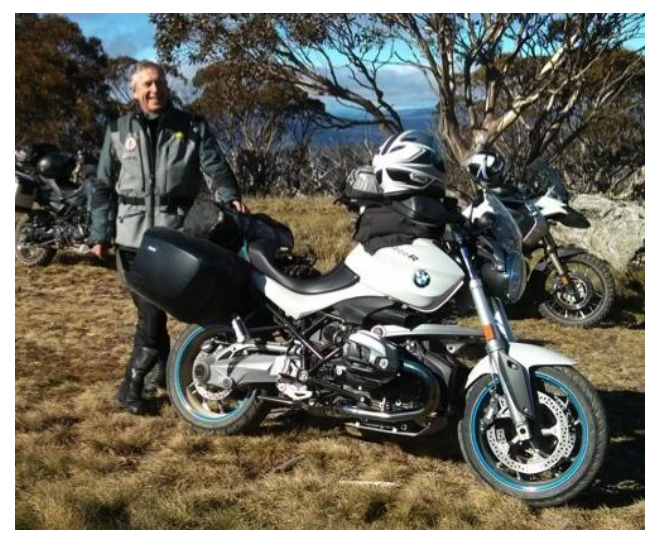
Club President and trusty R1200R @ Mt Ginini