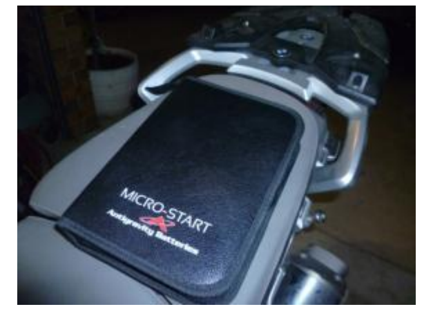
Antigravity Batteries Micro-Start PPS

Let me tell you that this bit of kit is a "must have" particularly if you do a lot of touring, or off-roading, where power sources are scarce, or you are in an unpopulated region. It is compact but very powerful, not only is it able to jump start bikes but also cars (we have used it twice on cars, one of which was a gas powered V8 which it started immediately). The manufacturer also claims the unit is able to start trucks, watercraft, ATVs/UTVs, and snowmobiles. In addition, the kit can also be used as a portable power supply to charge things like computers/tablets, cell phones, cameras, etc. However, if you only want to use the jump starter part of the