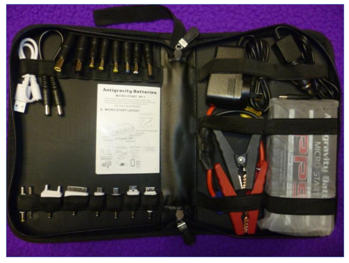
Micro-Start PPS showing organisation of components inside carrying case. PPS and jumper leads at lower right, with mains and car charger at top right.

So, what is in the box? In addition to the PPS and jumper leads, there is a USB connector, an extensive range of charging tips to fit most electronic devices and notebook computers. There is also a mains (wall) charger and a standard car charger to recharge the PPS.