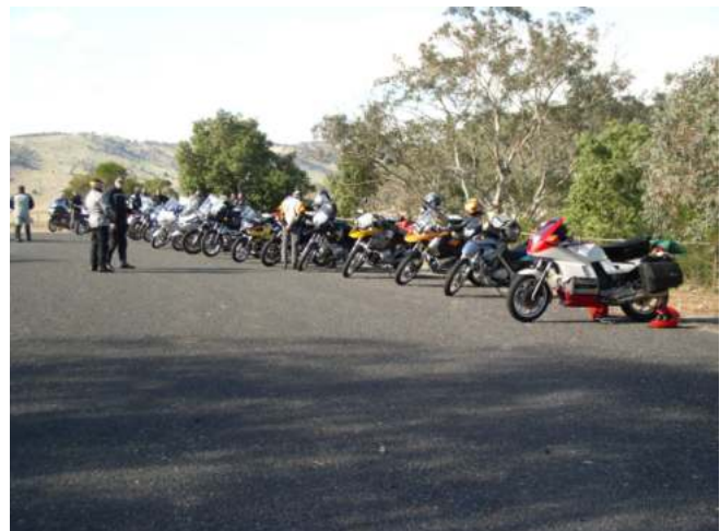
A stop at Wyangala Dam