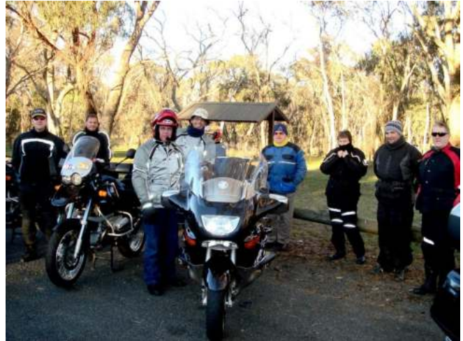
Meeting up at Hall layby before the ride to Gulgong

The country side around there is great at this time of the year, and there are some nice roads that follow the Lachlan River.