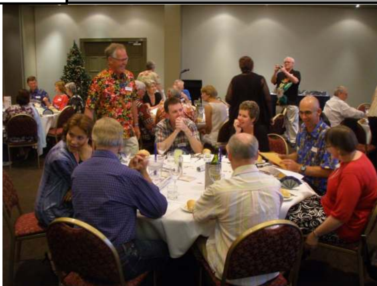
One of the tables at our Christmas Dinner