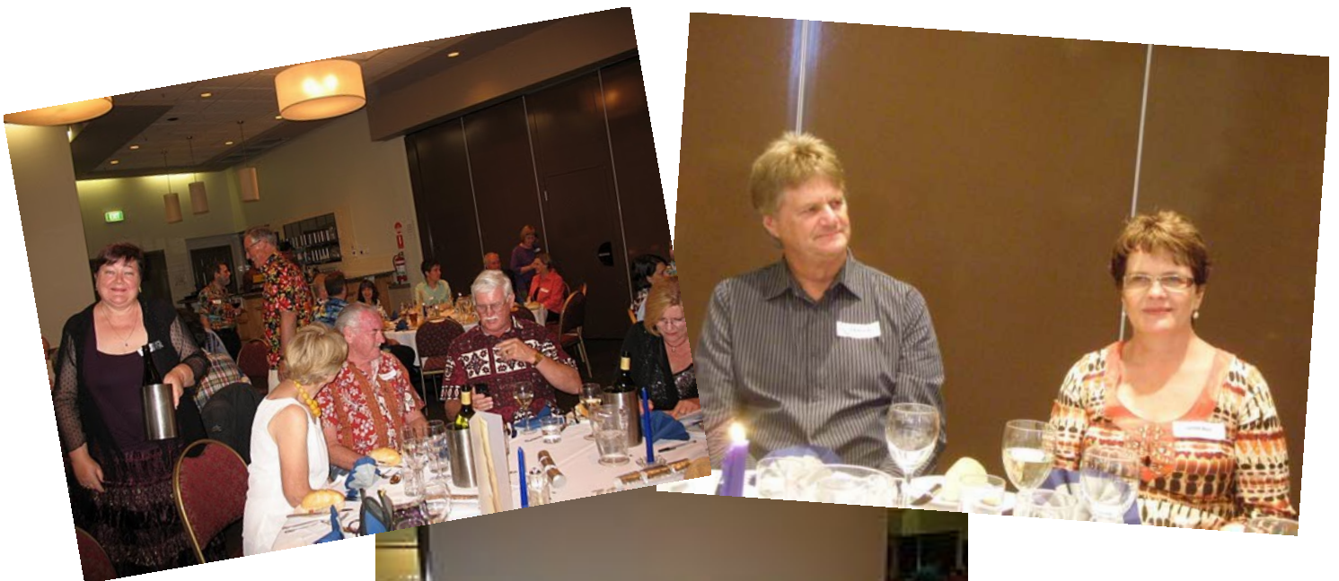
Some more pictures from the Christmas Dinner