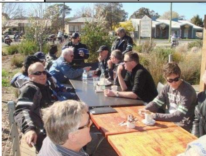
A Sunday morning get together at Bardy's