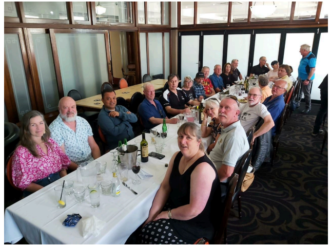
The 2022 Club Awards Lunch & Members Long Table at the Hotel Queanbeyan