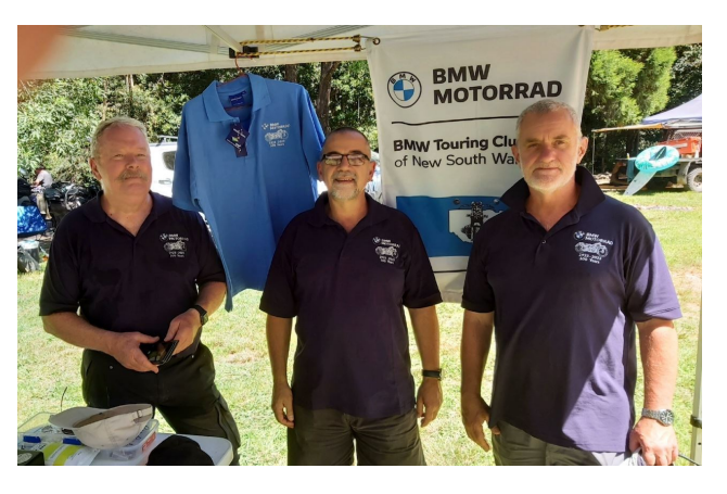
The Presidents BMWOCSA, BMWTCNSW and yours sporting Navy at the 2023 Karuah River Rally.

Shirts will be ordered in May for delivery ~6 weeks later and as a one off or so our South Aussie Club says.